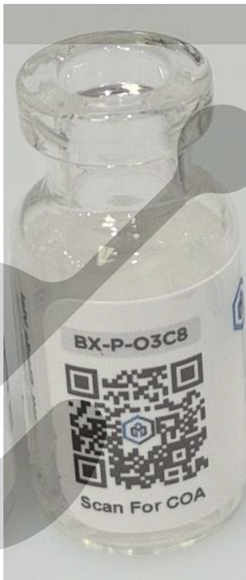
Attachment for SPL-2638 Filename: SPL-2638_Zoom.png